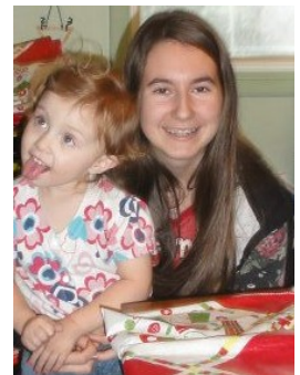
Myself and my 2nd cousin on Christmas Eve!